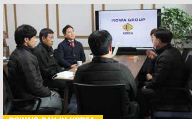
ROWA'S DAY IN KOREA