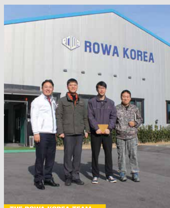
THE ROWA KOREA TEAM