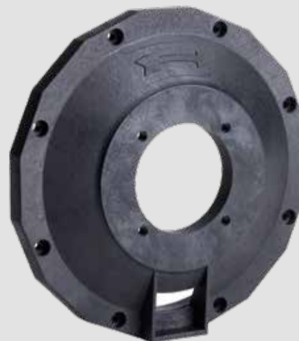
Cover cap for a water pump made using LURANYL® KR without flame protection