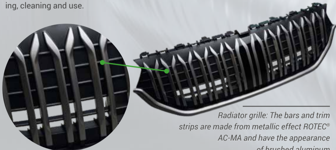
Radiator grille: The bars and trim strips are made from metallic effect ROTEC® AC-MA and have the appearance of brushed aluminum

The wishes of customers can be described as follows: Alongside an elegant design and aesthetic appearance, scratches should be barely visible and restoration and polishing should be simple and easy. Then there are the additional, customary requirements and demands of the automotive industry in terms of quality and durability with regard to weathering, cleaning and use.