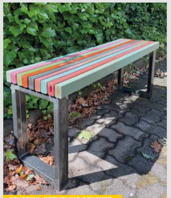
COLORFUL RECYCLING BENCHES

ROWA Masterbatch will continue to support the amazing projects and commitment of insel e.V. in the future and will most certainly be making its own bench in the future. ■