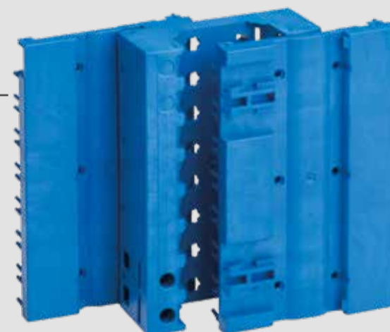
Relay for a switch cabinet made using flame-retardant LURANYL® KR compounds