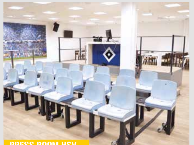
PRESS ROOM HSV

When someone finds a bench project is a little too small, entire walls can be produced if required. A tool is available for the extruder to produce so-called "bricks". The overall process is similar to putting Lego bricks together, except that the bricks are significantly larger and there are no limits to the color.